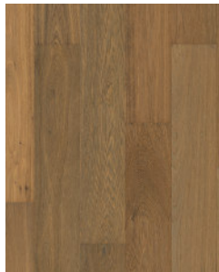
EICHE CAPPUCCINO WEISS EXTRAMATT