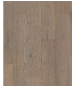
EICHE BAUMWOLLGRAU EXTRAMATT