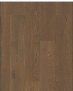
EICHE VINTAGE BRAUN EXTRAMATT