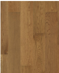
EICHE TOFFEE-BRAUN EXTRAMATT