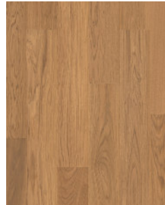
EICHE KASTANIE HELL EXTRAMATT