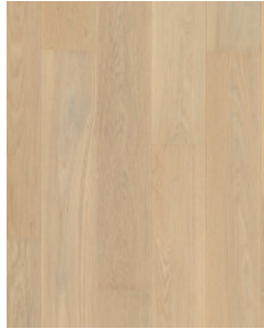
EICHE LILLENWEISS EXTRAMATT