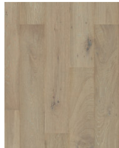
STURMEICHE HELL EXTRAMATT