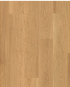
EICHE LEDER EXTRAMATT