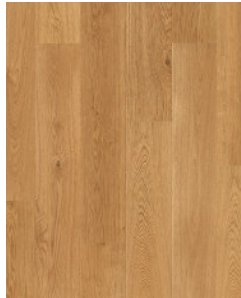
EICHE NATUR EXTRAMATT