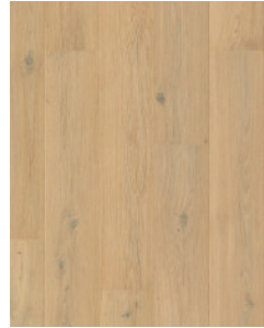
EICHE PERLWEISS EXTRAMATT